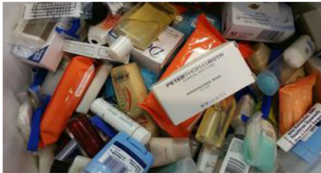
The IWIRC-Georgia Network collected numerous toiletry items for the Atlanta Day Women's Shelter.