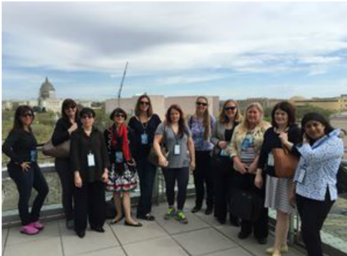
Left: IWIRC members enjoyed a guided tour of the Newseum as an intermezzo event on Thursday afternoon.