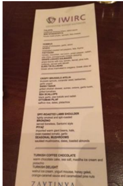
Right: On Wednesday, Conference attendees enjoyed a delicious dinner at DC hot-spot Zaytinya. Yes, that's 17 dishes . . .