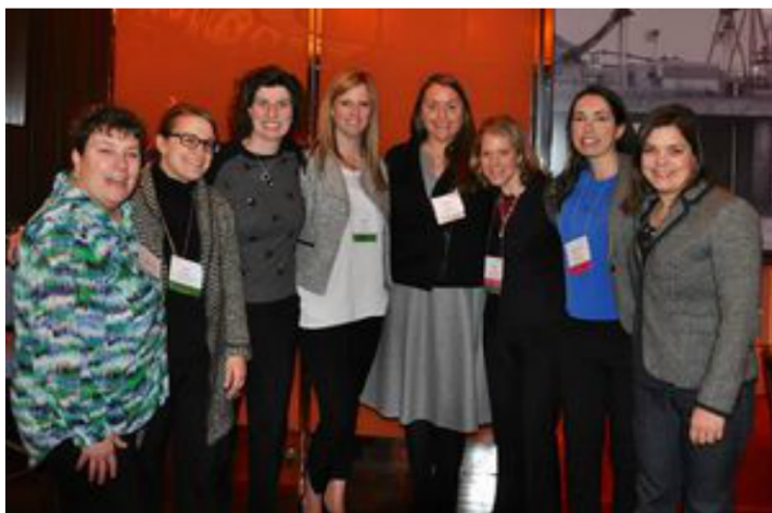
IWIRC at the Shore Planning Committee

Plans are already underway for next year's conference. Stay tuned for details.