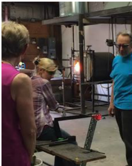
IWIRC-Georgia Network members enjoy a unique glassblowing networking event.

Coming up on August 22, the IWIRC-Georgia Network will team up with Habitat for Humanity for a Women's Build. The Women's Build allows the members of the IWIRC-Georgia Network to empower women while serving a great cause. More details will be forthcoming on this exciting service opportunity.