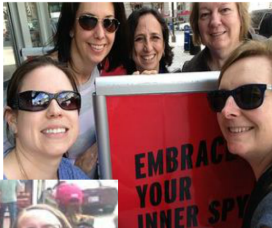
Below and Right: IWIRC members explored DC in competitive Scavenger Hunt as one of the intermezzo events on Thursday afternoon.