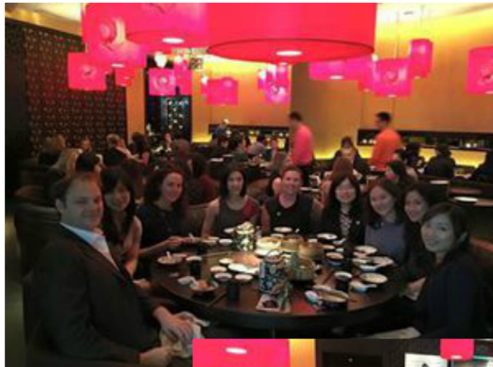
Chinese New Year Dim Sum lunch at Dragon-I, February 2015

Please like the IWIRC Hong Kong Facebook page so you can keep up to date with the Network's latest news and events!