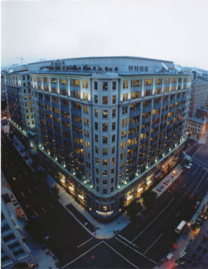
Left: The Conference kicked-off with views of the Washington Monument on the rooftop of Arnold & Porter, LLP, which once again hosted and sponsored the Opening Reception, along with Epiq Systems. The Opening Reception was also supported by IWIRC's Washington, DC, Greater Maryland, and Virginia Networks.