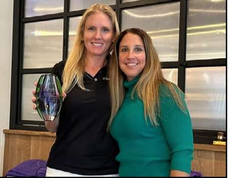
In February, members gathered for a Valentines Tea in Orlando, Florida!